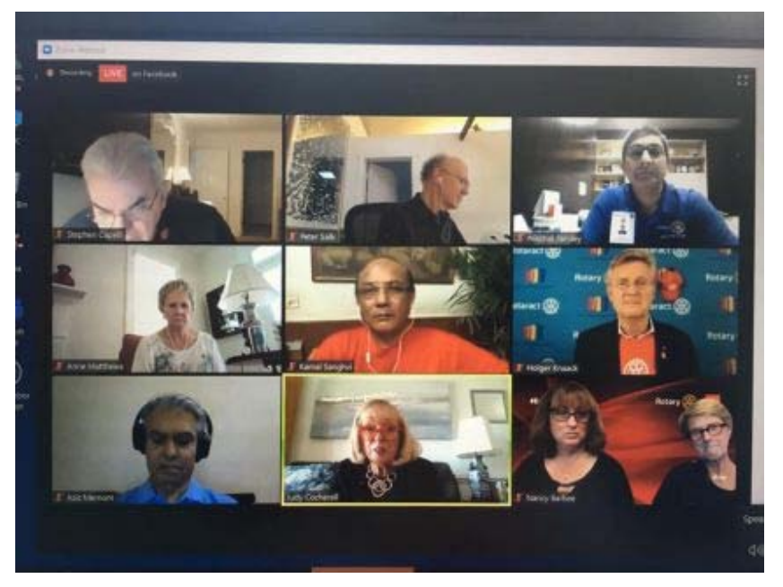
The PolioPlus Telethon, hosted by District 7600, D7630 and D7730 was a huge success. Read the details and a summary of some of the keynote speakers \underline{\textit{HERE}} .